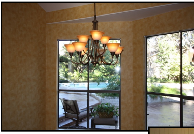
Breakfast Area Allows Views to: Family Room Kitchen Living Room Backyard, Patio and Pool

Family Room Features: High Ceilings Wood Laminate Flooring, Wood Paneling Storage Closet Built-In Shelves Glass Door Opening to the Backyard, Patio and Pool