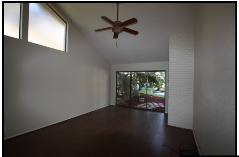
Master Bedroom Features: High Ceilings Wood Laminate Flooring Ceiling Fan With Light Sliding Glass Door to Backyard, Patio and Pool

Remodeled Master Bath Features: Two Vanities Granite Counter Tops Beautiful Wallpaper Framed Mirrors Whirlpool Tub w Shower Ceramic Tile Flooring